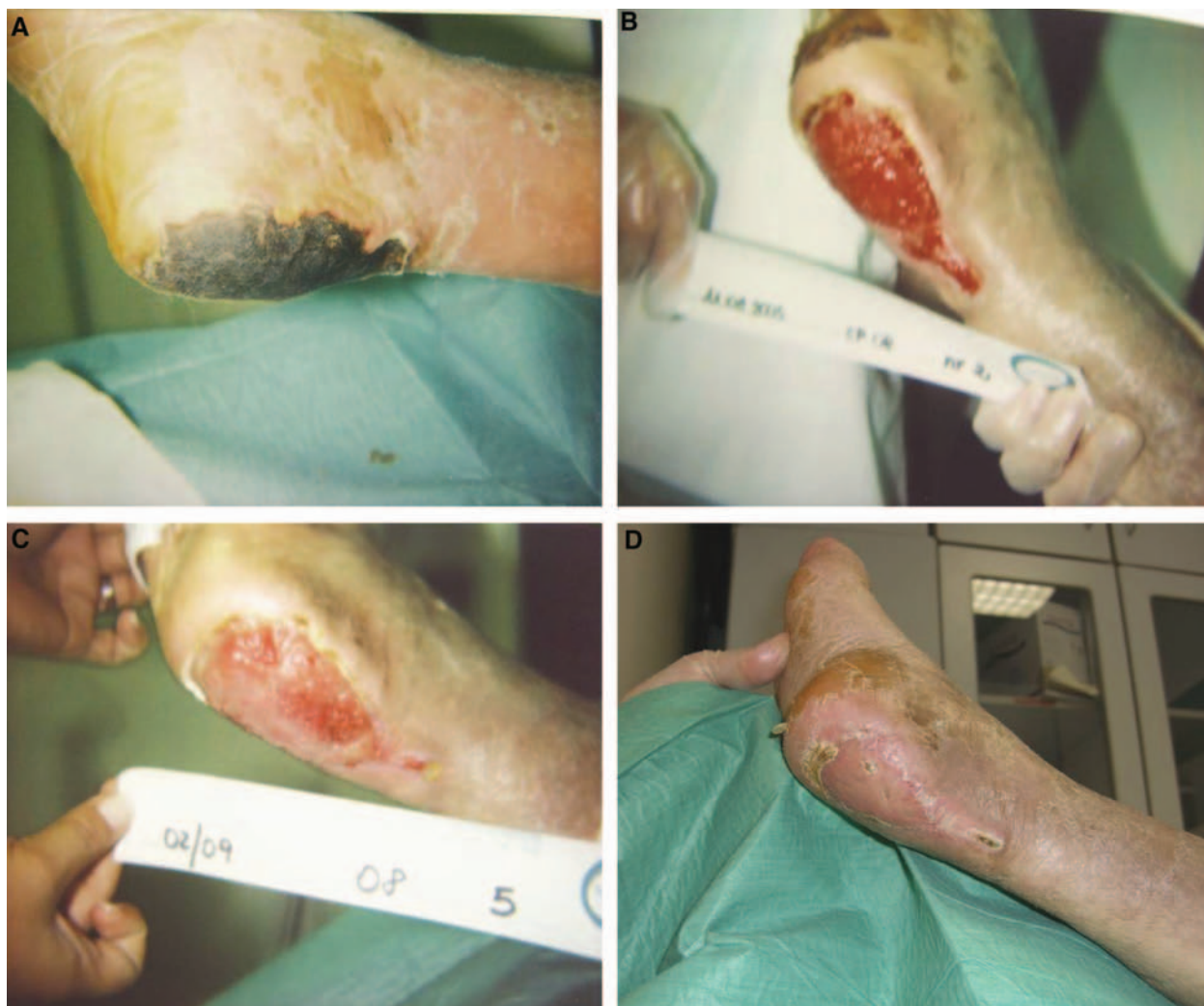
Fig. 2 A case managed with Dermacyn. A) a wide necrotic area in the Achilles tendon region caused by the presence of ischemia and infection induced by trauma from shoes. B) The patient after revascularization, surgical debridement, and 2 weeks of treatment with Dermacyn-saturated dressings. Granulation tissue is present over 100% of the lesion and completely covers the exposed tendon. C) The lesion after another month of treatment with Dermacyn-saturated dressings. A reduction of 25% of the lesion area is noticeable in addition to reduction of the perilesional inflammation signs. This lesion was then suitable for grafting. D) The lesion 3 weeks after the grafting procedure. Complete epithelialization has occurred.

was significantly higher in group A than in group B (87.5% vs 51.4%, P = .00827 ).